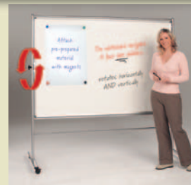
PIVOTING ON HORIZONTAL AXIS