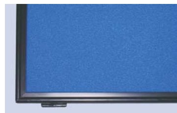
Panel connecting clip

Lift up the 2nd set of 4 panels and place on top of the 1st set Push downwards onto each panel to secure the connecting clips